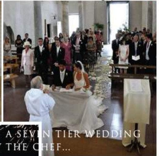
THE PIECE DE RESISTANCE WAS A SEVEN TIER WEDDING CAKE PREPARED BY THE CHEF...